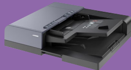
DP-7150 document processor (140 sheet, with auto-reverse function)