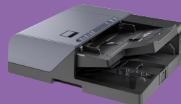
DP-7160 dual scan document processor (320 sheet)