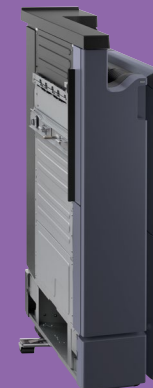
ZF-7100 Z-fold unit* (incl. AK-7120)