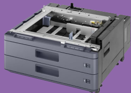
PF-7140 universal cassettes (2 x 500 sheet)