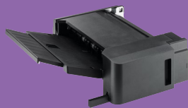
DF-7100 internal finisher (available for 6009ci/6059i) (500 sheet), stapling (50 sheet) and optional hole punch unit PH-7120